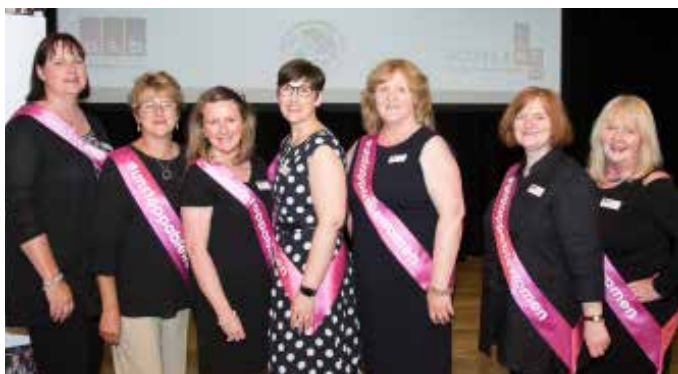
ASB committee members at the 2018 Unstoppable Women Conference

The ASB is run by a voluntary Executive Committee who freely give of their time, business skills, experience and connections for the benefit of the organisation and its members. The committee is made up of officer bearers, ordinary members and the chair and vice-chair of the affiliates sub-committee to represent all the ASB clubs throughout Scotland. The Executive Committee meet approximately once every month.